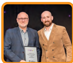
Social Value Employer of the Year Awarded to Aico

sponsored by Jewsons Partnership Solutions