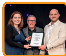
Social Value Impact Award Awarded to The Guinness Partnership sponsored by Twyford